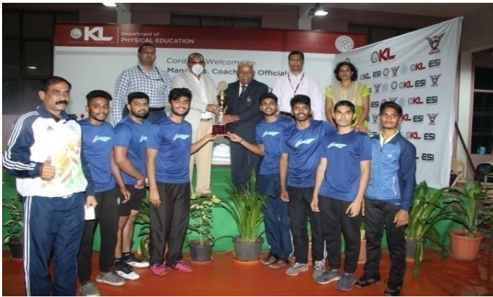
3 rd Place-Andhra University, Andhra Pradesh