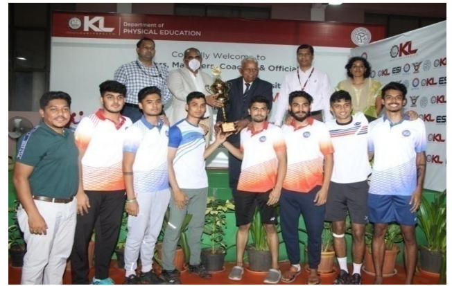
4 th Place-University of Calicut, Kerala