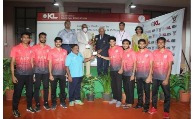
2 nd Place-SRM University, Tamilnadu