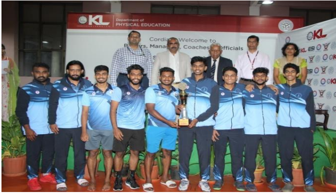
1 st Place-Jain University, Karnataka